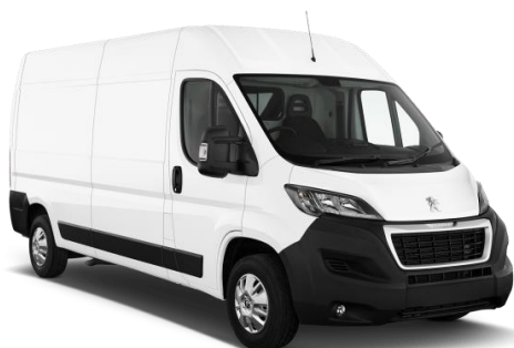
Peugeot Boxer 4X4 p. 6