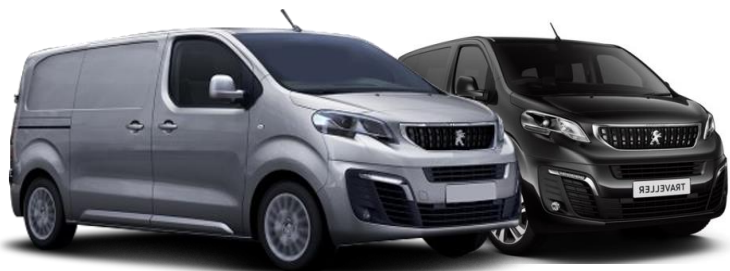
Peugeot New Expert/Traveller Trek & 4X4 p. 4 & 5