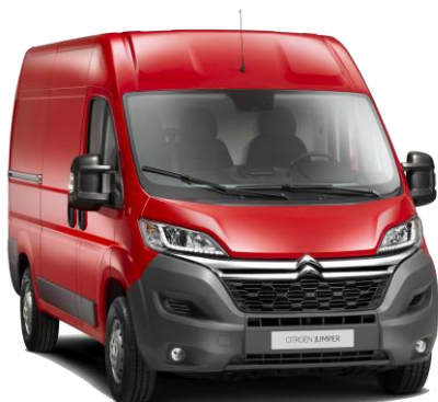
Citroën Jumper 4X4