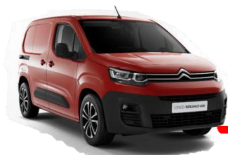
Citroën Berlingo Trek 2WD & 4x4