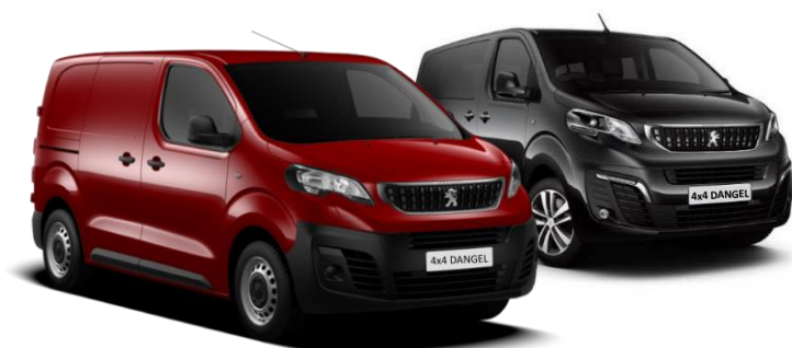
Peugeot New Expert/Traveller Trek & 4X4 p. 4 & 5