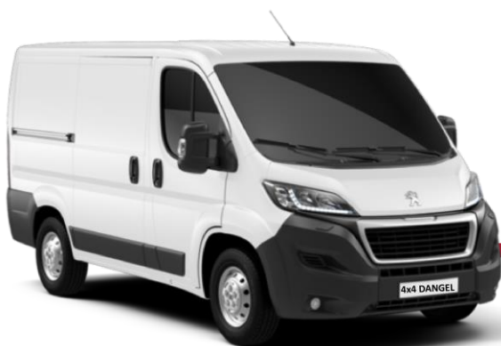
Peugeot Boxer 4X4 p. 6