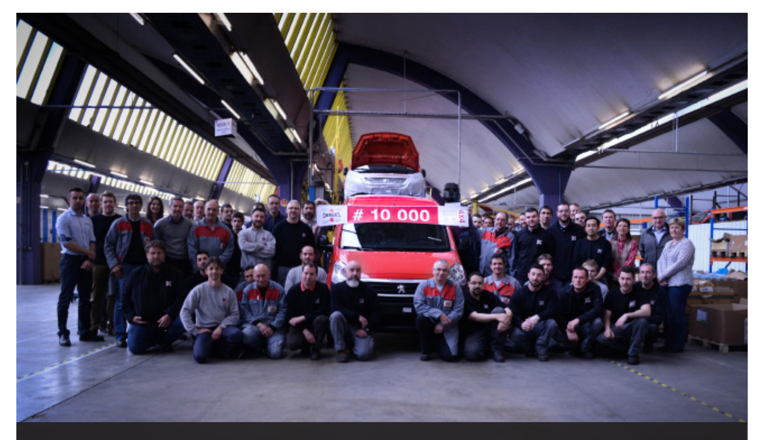
The (almost) entire Dangel team smiling in front of the 10, 000th vehicle to come off the line.