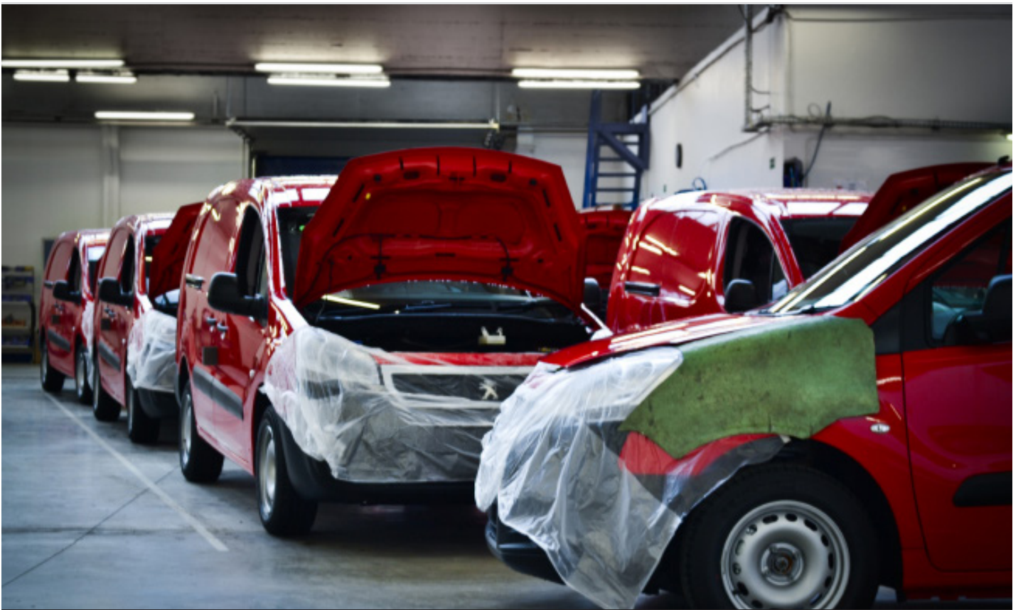
The 10,000th vehicle: part of an order for 300 vehicles from the Norwegian post office.