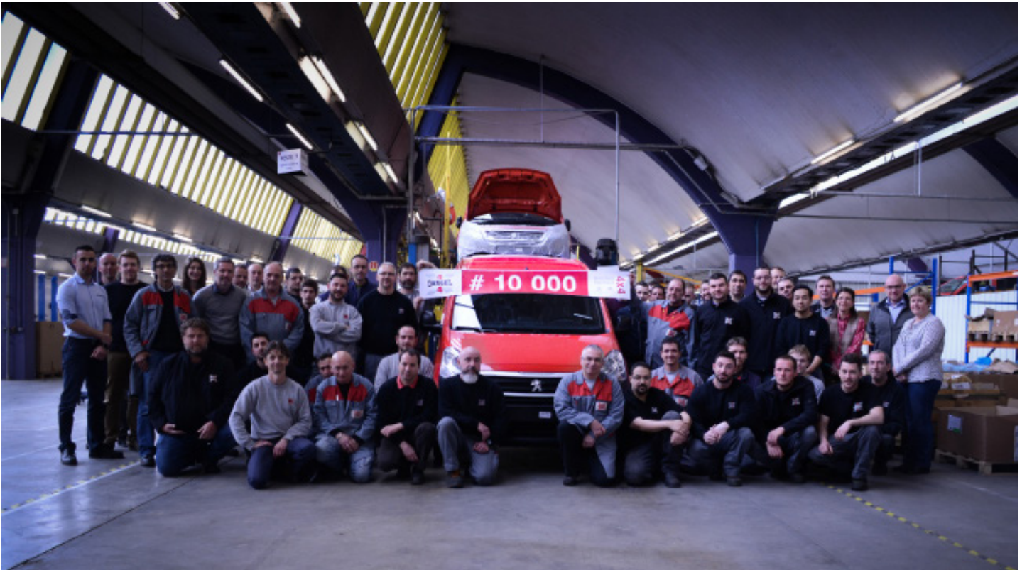
The (almost) entire Dangel team smiling in front of the 10, 000th vehicle to come off the line.